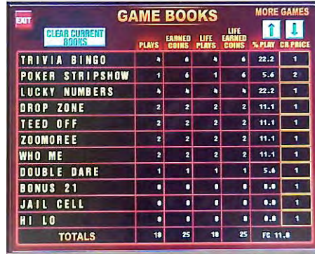
Figure 2 – Game Books Screen

(Games are listed in order of “Earned Coins”)