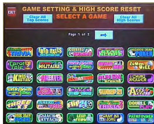
Figure 5 – Game Setting & High Score Reset Screen

Touching a game icon on this screen opens a set of sub screens to allow for the setting of individual game options. Individual options will vary for each game, should any options require further explanation, call our service department at (732) 905 6662 ext 36 for clarification.