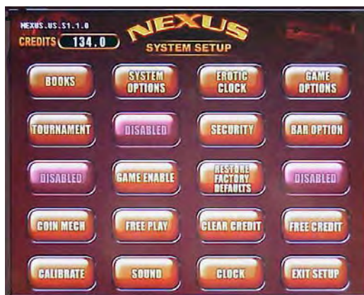
Figure 1-System Setup Screen

To enter the System Setup Screen, open the cash door and press the button labeled SETUP. From this screen you can access the operator adjustable features and controls. Push a button on the screen to get started.