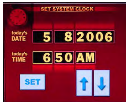
Figure 11 – Clock Screen

Touch the box you need to change then use the arrow buttons to toggle through available options. EXIT returns you to the System Setup Screen.