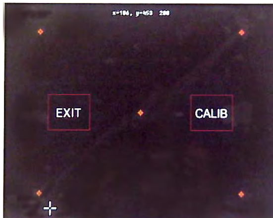
Figure 8 – Calibration Screen

The calibration screen allows the touch screen performance to be easily optimized.