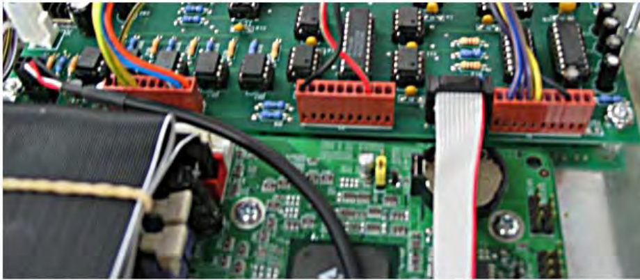
CLOSE UP OF RIBBON CABLE CONNECTIONS