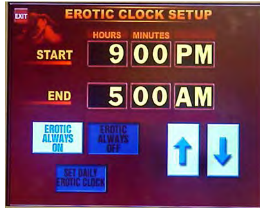
Figure 4 – Erotic Clock Screen

Choose to have the “EROTIC ALWAYS ON”, “EROTIC ALWAYS OFF”, or “SET DAILY EROTIC CLOCK” to enable Erotic games at appropriate times. To set the clock, touch the box you wish to change, then use the arrow buttons to scroll through the options available. EXIT button returns you to the System Setup Screen.