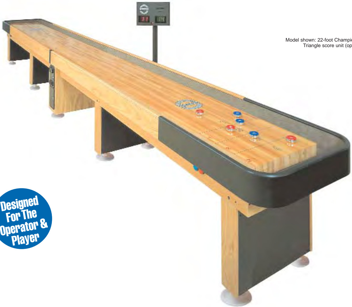
Model shown: 22-foot Champion with Triangle score unit (optional).