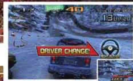
Driver Change Mode