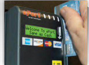
Credit/Debit card reader options.