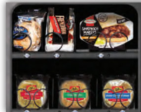
Vends all types of frozen meals, sandwiches & deserts.