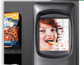
Back lighted point of sale window for advertising and specials.