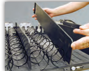
Re-configure trays to almost any package size in the field with no need for tools.