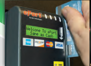
Credit/Debit card reader options.