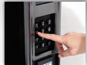
Large and easy to read selection buttons with Braille identification.