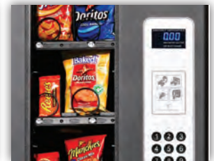
Also Dispenses Snacks

Keeps customers satisfied and reduces service calls for misloaded product.