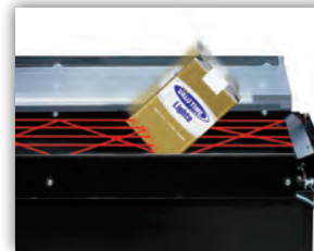
iVend® Guaranteed Delivery System

Keeps customers satisfied and reduces service calls for misloaded product.