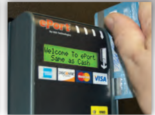
Credit/Debit card reader options.

Communicates price, monies and sold out status.