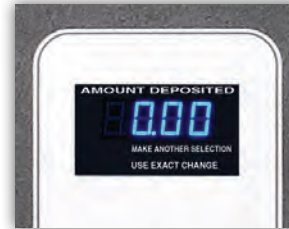
Bright LED Display

Communicates price, monies and sold out status.