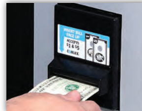
Premium Currency Acceptors

Add to your merchandising by vending snacks or candies.