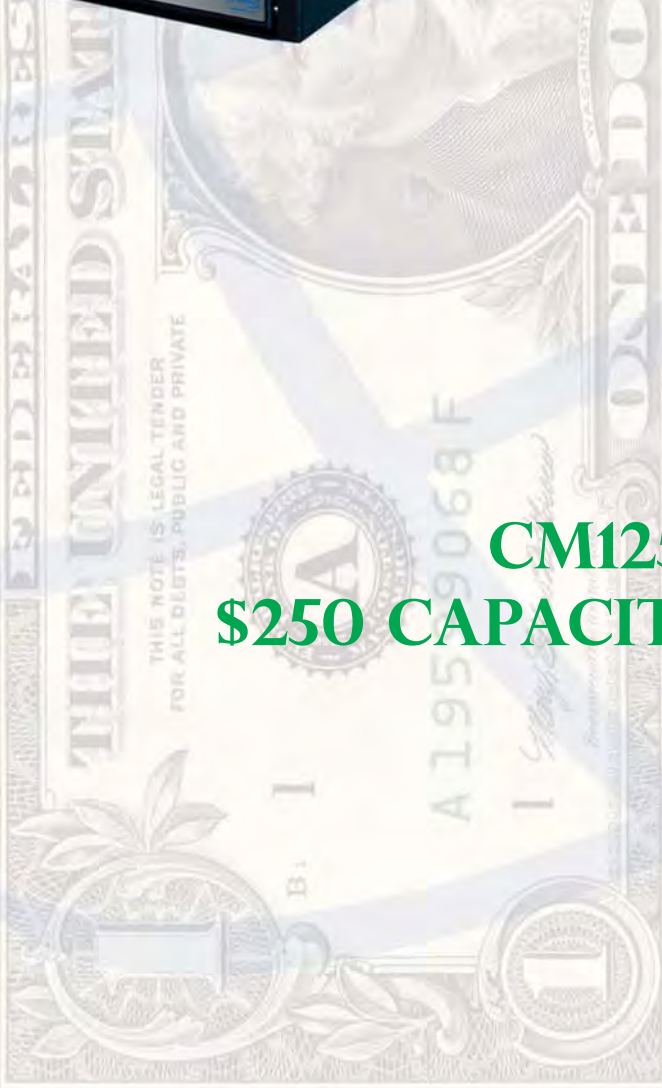
CM1250 $250 CAPACITY