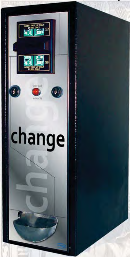
CM1050 $120 CAPACITY