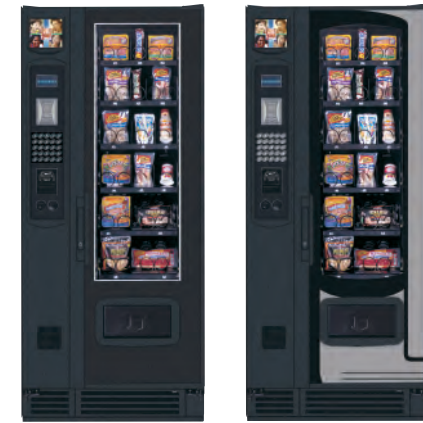
SC100/CF 1000 Cold Food Vendor