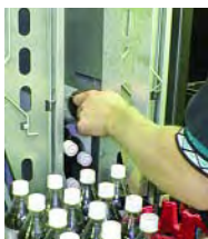
Easy Loading Product Stacks