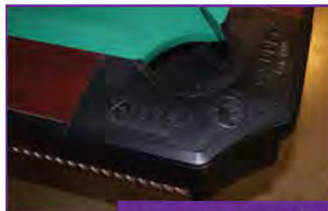
Top corner assembly has flush mount casting