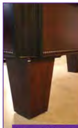
Tapered "Statesmen" leg design