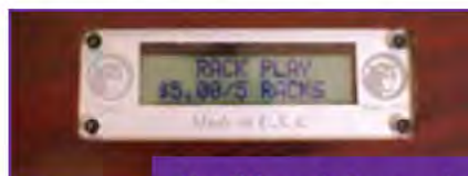
Flexible pricing options - Bonus and Happy Hour