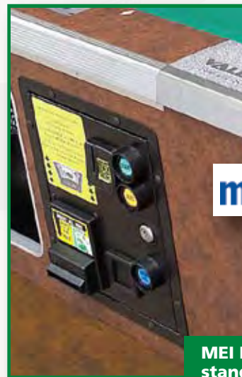
MEI Bill Acceptor standard on every table