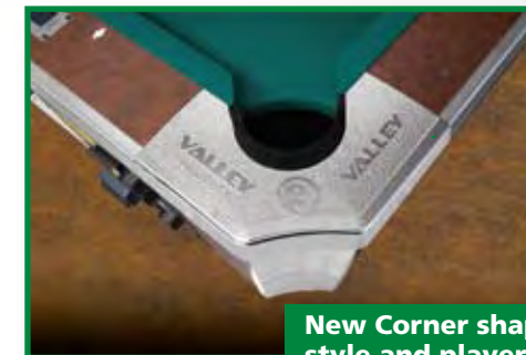
New Corner shape for style and player comfort