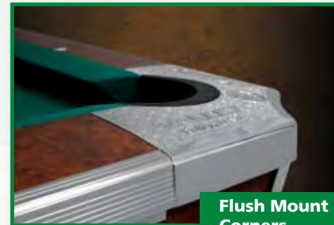
Flush Mount Corners