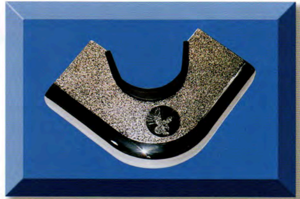
Stylish die cast reinforced, polished chrome-plated corners with Eagle logo, feature advanced screw in pocket liners for ease in replacement.