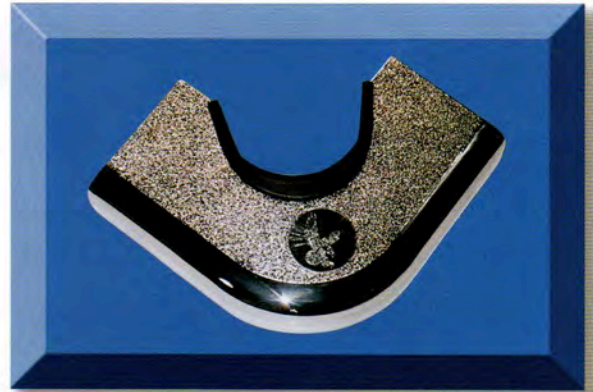
Stylish die cast reinforced, polished chrome-plated corners with Eagle logo, feature advanced screw in pocket liners for ease in replacement.