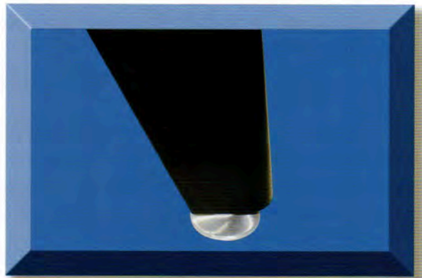
Nylon mesh continual reinforced ABS injected legs with adjustable levelers, durable for many years of reliable service.