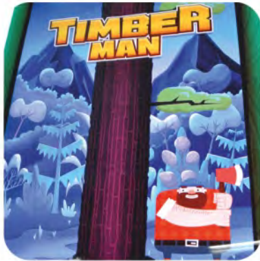
COLORFULL HD GRAPHIC