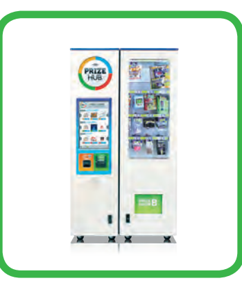
Main Hub + Spindle Hub