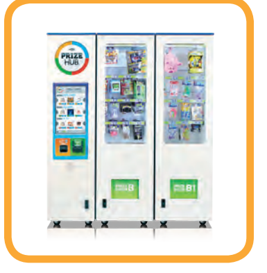
Main Hub + 2 Spindle Hubs