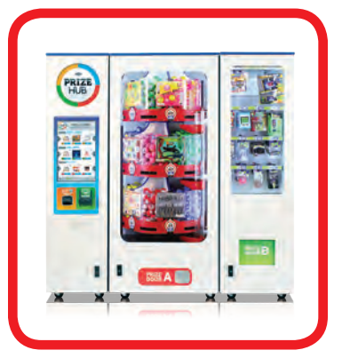
Main Hub + Capsule Hub