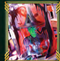
THE WICKED WITCH OF THE WEST™