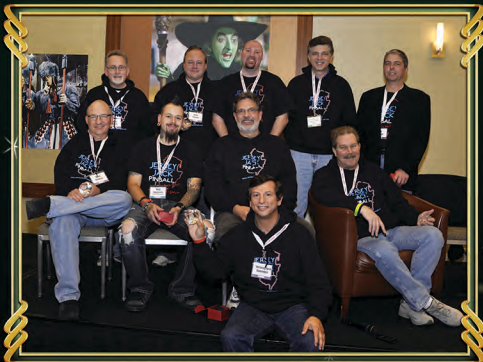
THE JJP DESIGN TEAM

Shoot into the Crystal Ball to learn what happens next, spin the House for a chance to visit the Munchkins, and activate the Winged Monkey™ , he will capture Dorothy™ and bring her to the Castle. Shoot the Winkie Guard™ Target to rescue Dorothy .