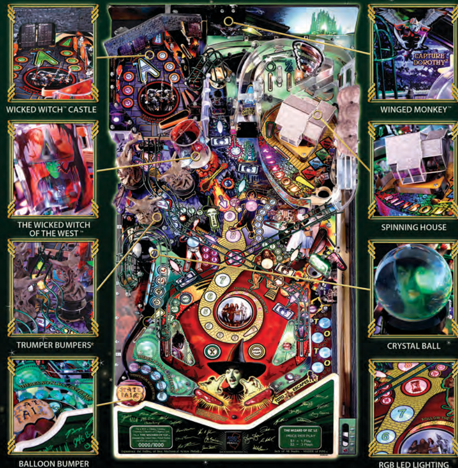
WICKED WITCH™ CASTLE

Rescue Dorothy™ from the Castle of the Wicked Witch of the West™, spin the House through the Twister and visit the odd and colorful Munchkinland. You're definitely not in Kansas any more!