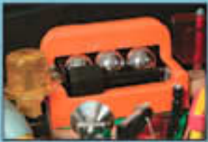
Lock balls in the upper playfield couch to start multiball.