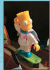
Hit the captive ball to send Bart skateboarding