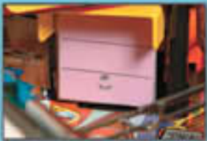
Bash the garage door to get into the living room on the second level!