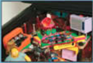
Two ramps feed upper playfield and its two flippers.