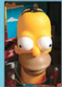
Homer's head lights up and moves as he talks