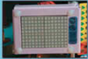
Pinball's first ever Tri-color Information Display