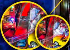
RAMPS UP RAMPS DOWN