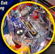
360° DEGREE BONUS BOWL