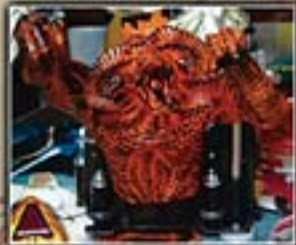
Players bash on the angry Balrog.