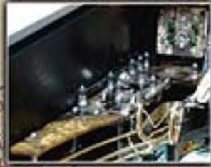
Players can collect Souls on The Paths of the Dead ...an upper playfield.