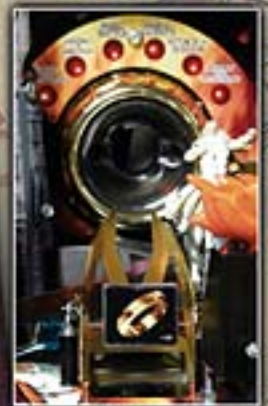
The jump ramp launches the ball into The One Ring™ and the magnet pulls it through.