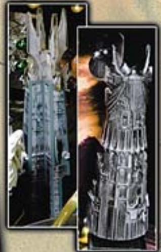
The Two Towers, Orthanc and Barad-Dur. Players can knock down Barad-Dur to face the eye of Sauron.