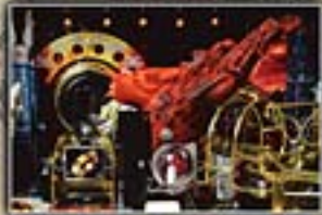
The Balrog guards the jump ramp that leads to The One Ring™.