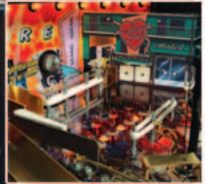
Check in at the Heartbreak Hotel from a transparent upper playfield.