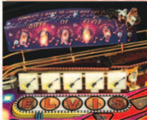
Takin' care of business with the 5-bank drop targets.