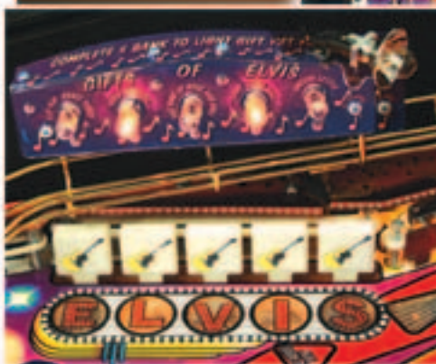
Takin' care of business with the 5-bank drop targets.