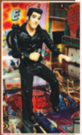
Elvis sings & dances to 8 authentic Elvis recordings!