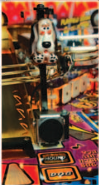
Ain't nothing but a Hound Dog shot!