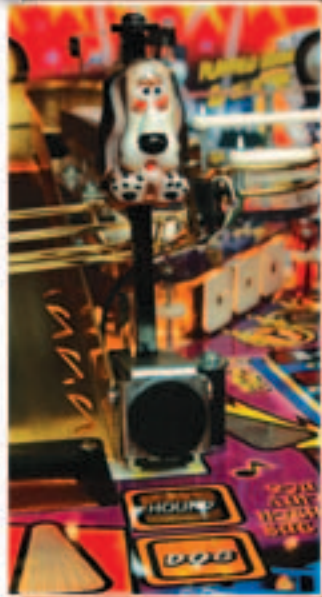
Ain't nothing but a Hound Dog shot!