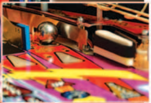
Man, that magnet helps you flip the orbit shot.