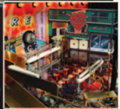
Check in at the Heartbreak Hotel from a transparent upper playfield.