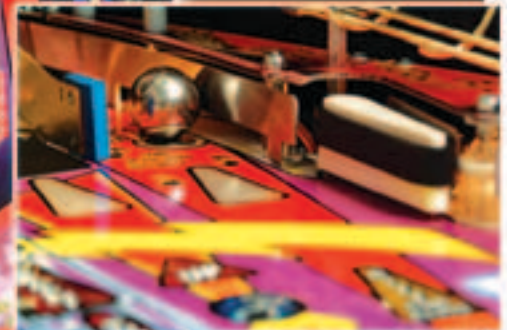
Man, that magnet helps you flip the orbit shot.