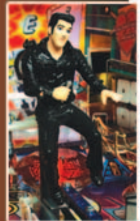
Elvis sings & dances to 8 authentic Elvis recordings!