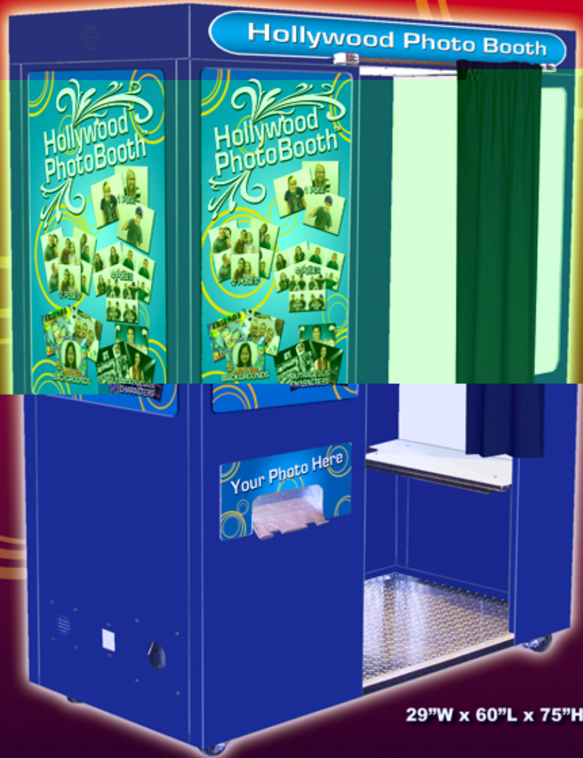
29"W x 60"L x 75"H