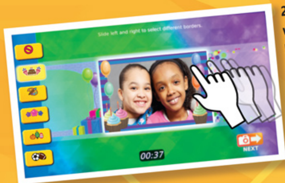
24" HD LCD Touchscreen with Dazzling Graphics! Fun, Easy-to-Use Smartphone User Interface with Interactive Borders and Digital Stickers.