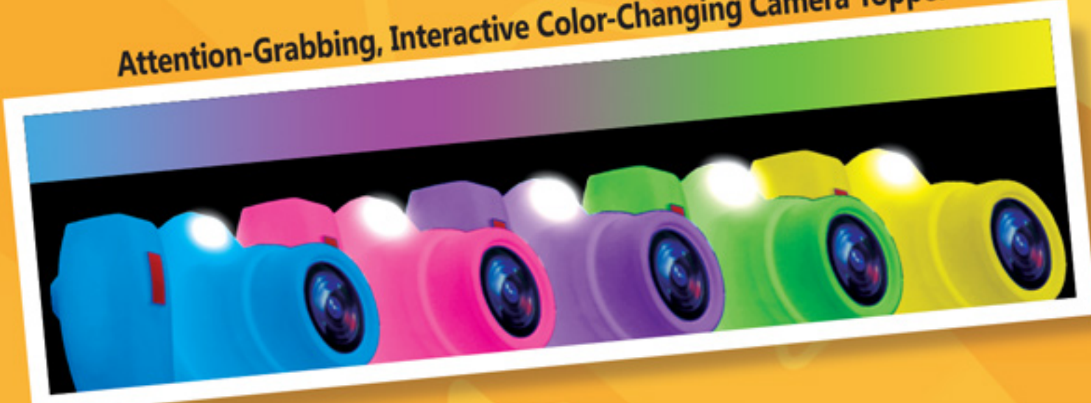
Attention-Grabbing, Interactive Color-Changing Camera Topper