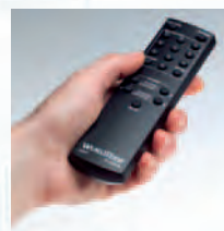
Full-function remote control