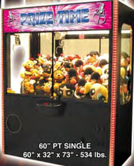
60" PT SINGLE 60" x 32" x 73" - 534 lbs.