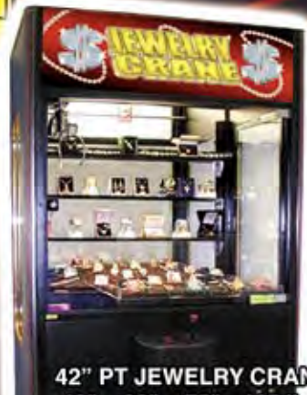
42" PT JEWELRY CRANE 42" x 32" x 75" - 465 lbs.