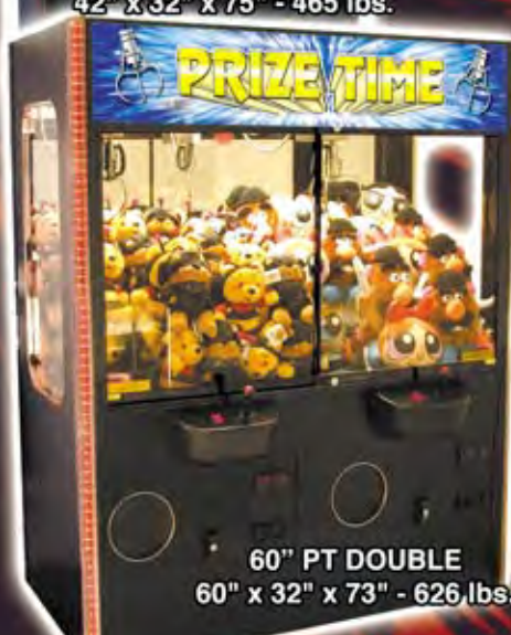
60" PT DOUBLE 60" x 32" x 73" - 626 lbs.