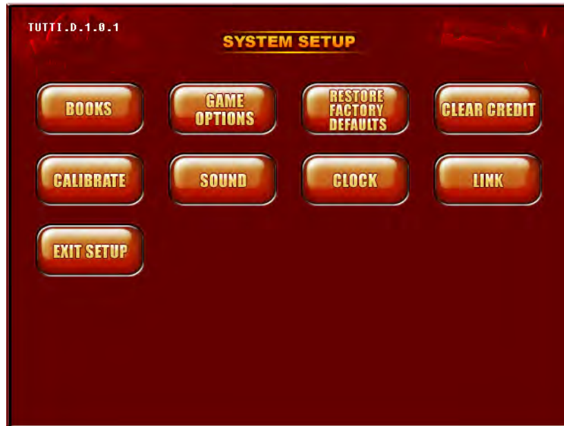
System Setup Screen

Enter the system setup screen by using the key switch on the side of the cabinet, nearest the front of the game. The second key switch will take you directly to screen calibration. The third switch is used to clear 'out of ticket' and 'attendant pay' errors. From this screen you can access the operator adjustable features and check bookkeeping. The next pages will explain the different sections: