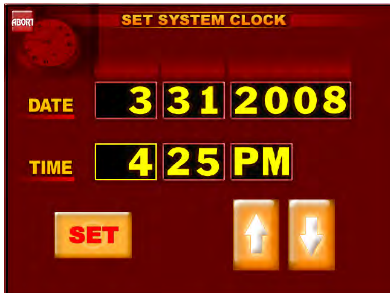
System Clock Screen

This screen is for adjusting the current date/time. Press the box you wish to change, and use the arrows to change the value. Press set when you are done.