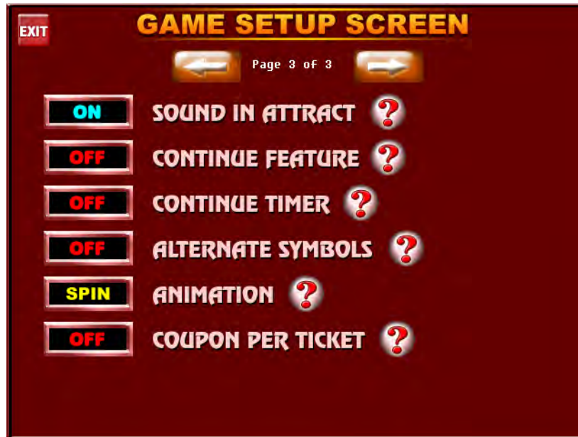
System Options Screen – Page 3

SOUND IN ATTRACT: Turns sound and voice on or off in attract mode only. Both voice and sound are always on in game play.