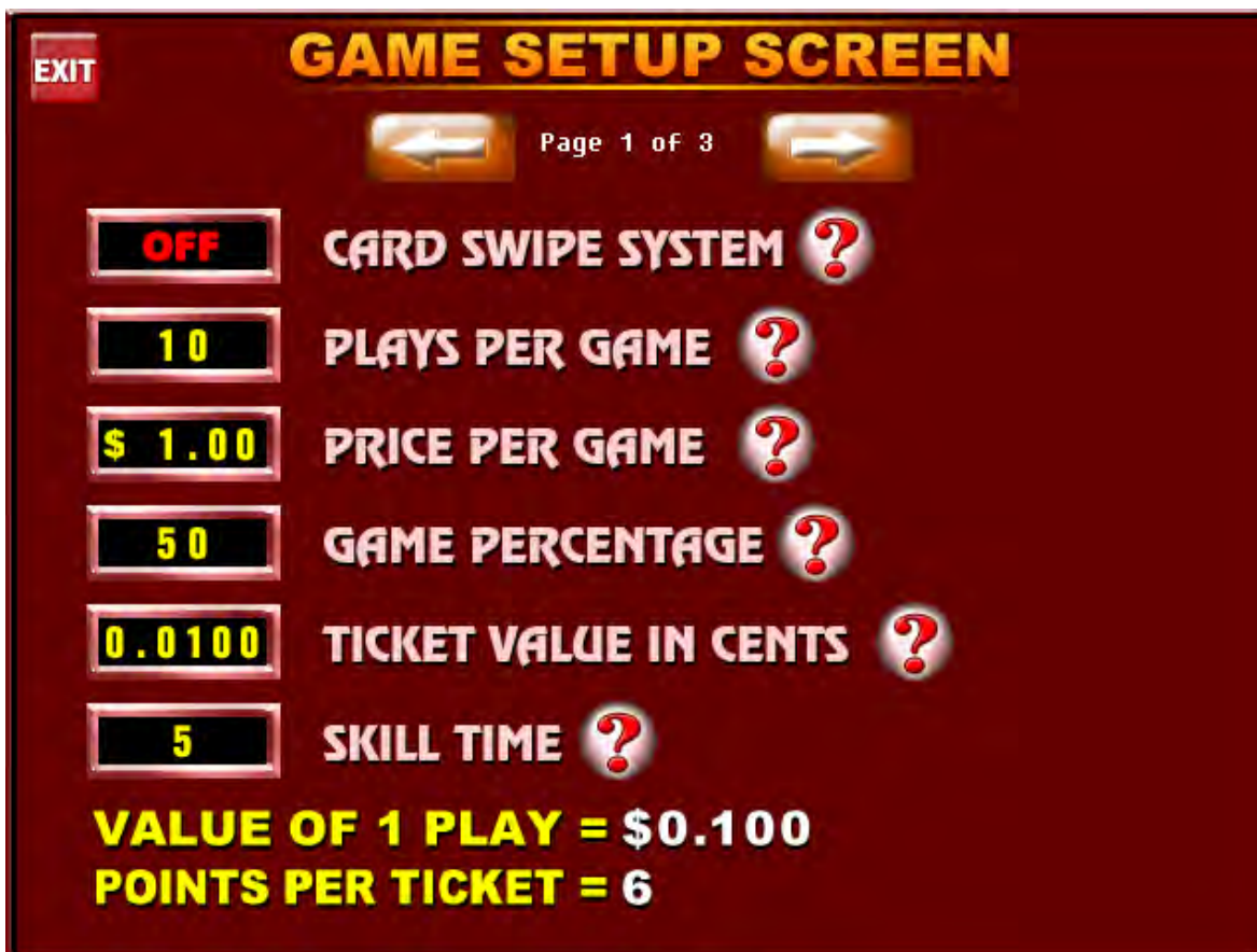
System Option Screen - Page 1

CARD SWIPE SYSTEM: Set this to ON if you are using a card swipe system.