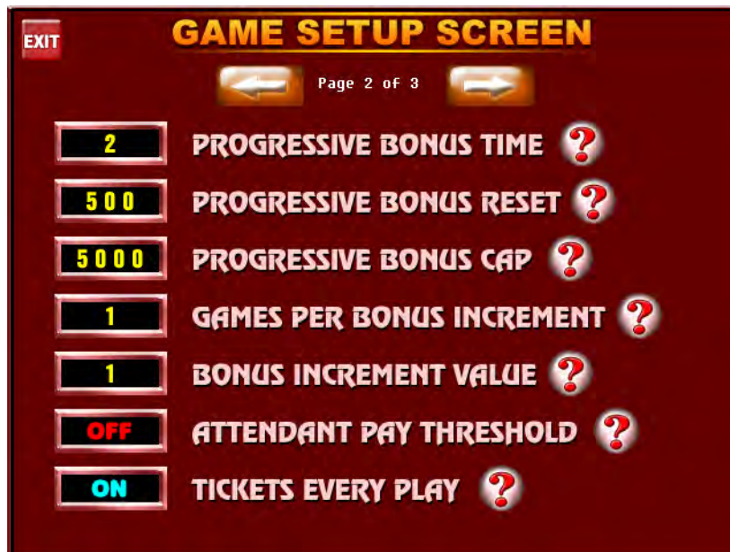
System Option Screen – Page 2

PROGRESSIVE BONUS TIME: Sets the minimum time needed to select 3 wilds and win the progressive bonus.