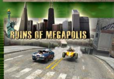
RUINS OF MEGAPOLIS