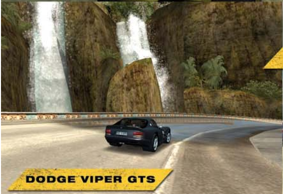
DODGE VIPER GTS