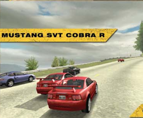
MUSTANG SVT COBRA R