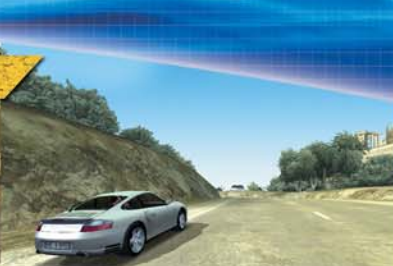
PORSCHE 911 TURBO