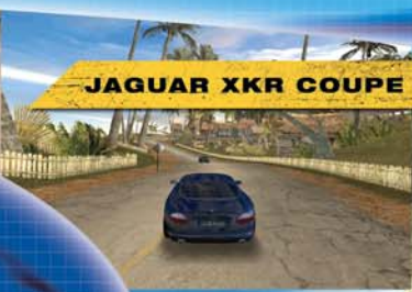
JAGUAR XKR COUPE