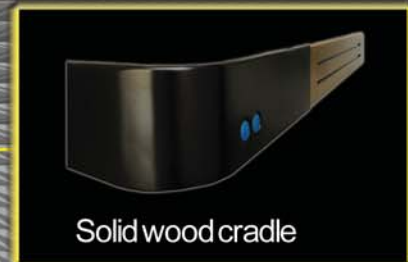
Solid wood cradle