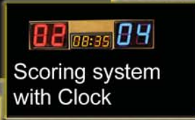
Scoring system with Clock