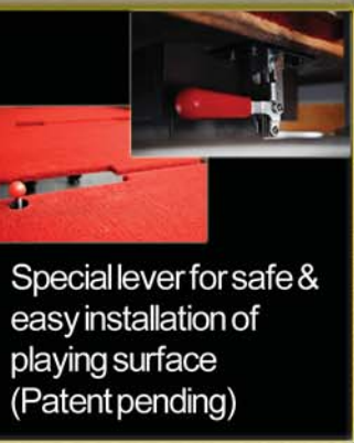
Special lever for safe & easy installation of playing surface (Patent pending)