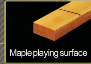
Maple playing surface