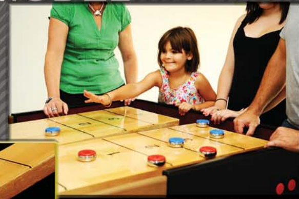
Fun for the whole family