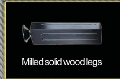
Milled solid wood legs