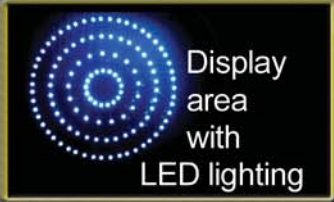
Display area with LED lighting