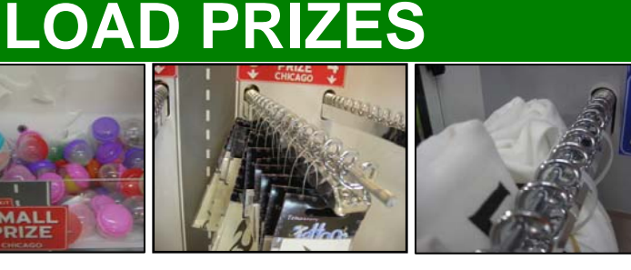
2. Hang prizes on all empty spindles. Space prizes out careful not to place more than one prize per coil.