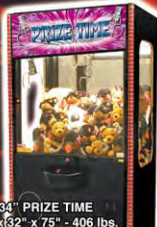
34" PRIZE TIME 34" x 32" x 75" - 406 lbs.