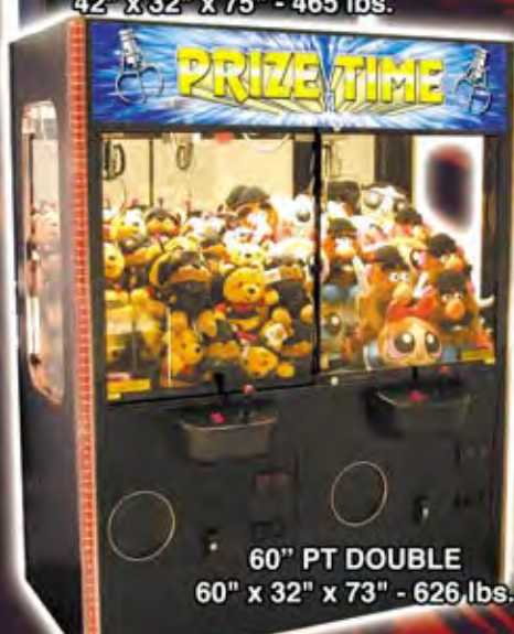
60" PT DOUBLE 60" x 32" x 73" - 626 lbs.