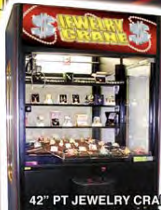
42" PT JEWELRY CRANE 42" x 32" x 75" - 465 lbs.