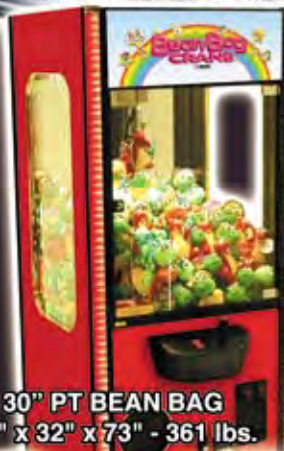
30" PT BEAN BAG 30" x 32" x 73" - 361 lbs.

SMART CRANES WORK SMART EXCLUSIVE 3 YEAR LIMITED WARRANTY