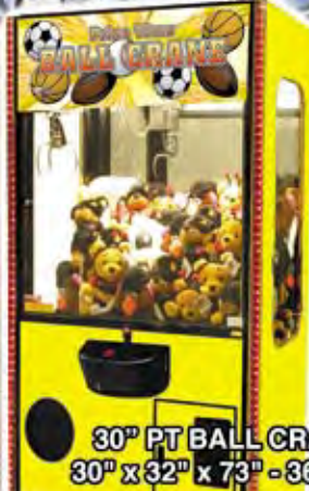
30" PT BALL CRANE 30" x 32" x 73" - 361 lbs.