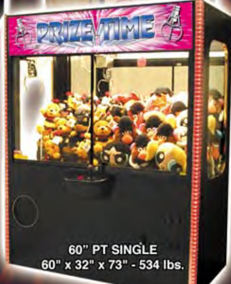
60" PT SINGLE 60" x 32" x 73" - 534 lbs.