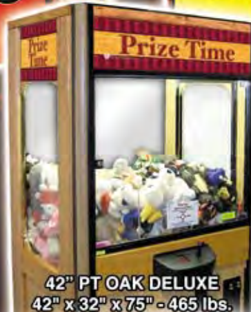
42" PT OAK DELUXE 42" x 32" x 75" - 465 lbs.